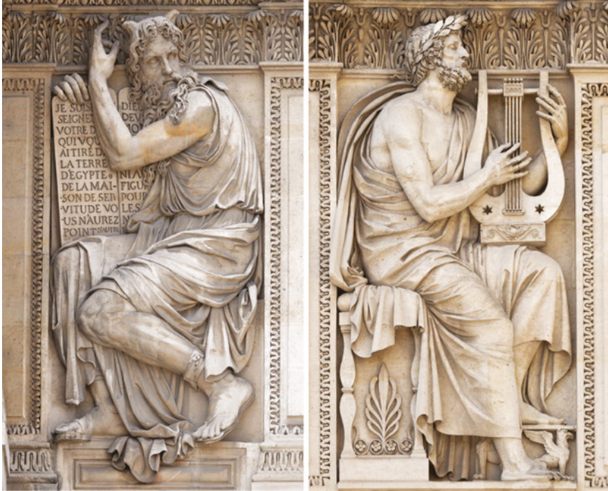
FIGURE 6 Relief of Moses (left) and Homer (right) on the Louvre, Paris. On the east façade of the Lemercier Wing and west façade of the Square Court, respectively. Sculpture by Jean-Guillaume Moitte and Antoine-Denis Chaudet, 1806.